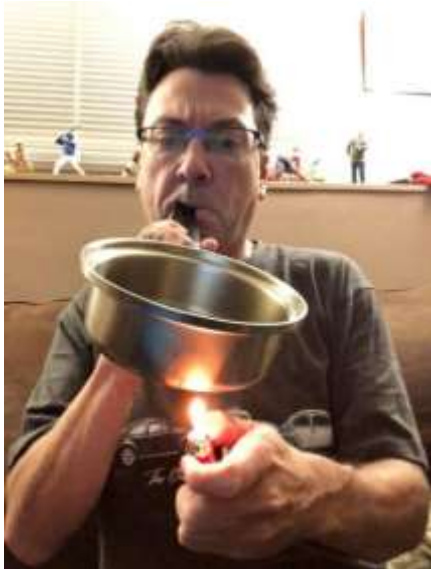
Have you heard that pot smoking is now legal in Canada!