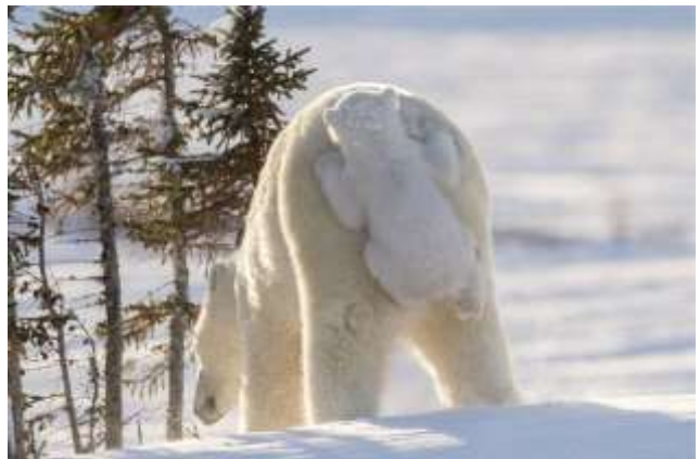
Just hanging around.