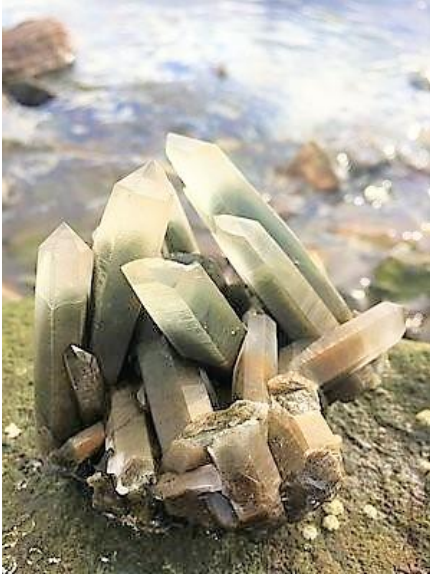
FOREST CRYSTAL CLUSTER