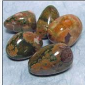
Rhyolite also known as Rainforest Jasper