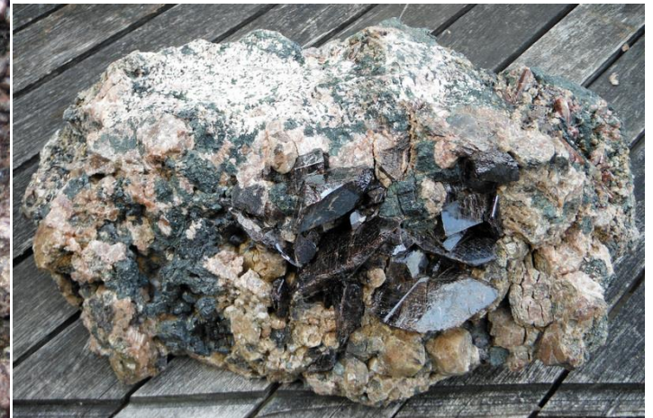
Minerals found at the Smart Mine