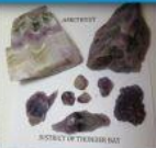
ROBERT W. THREMBER INC.